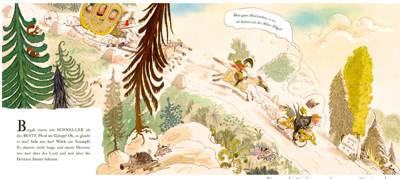
Downhill: faster than a golloping horse

with two wheels for people to ride: the fabulously useful and utterly amazing BICYCLE!